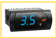
Electronic control with temperature display