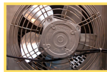
Powerful internal fan ensures consistent temperatures and frost-free display