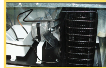
Fan assisted condenser