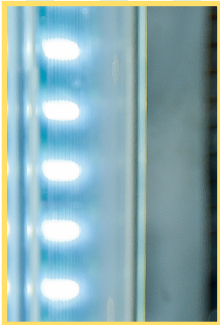
Twin vertical interior LED side lights