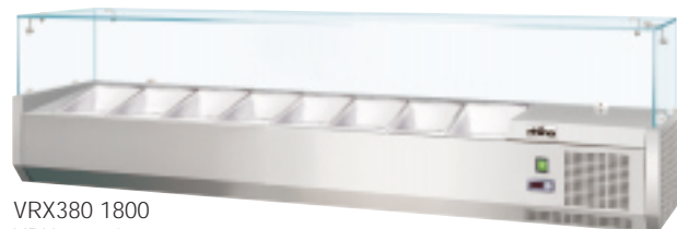
VRX380 1800 VRX330 1800