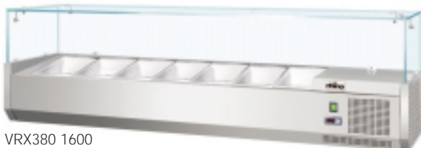
VRX380 1600 VRX330 1600