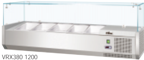
VRX380 1200 VRX330 1200