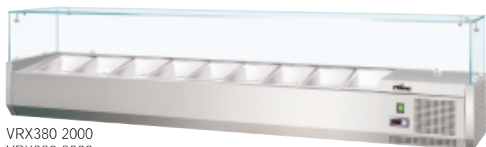
VRX380 2000 VRX330 2000