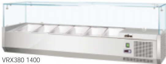
VRX380 1400 VRX330 1400