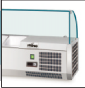
Curved top option