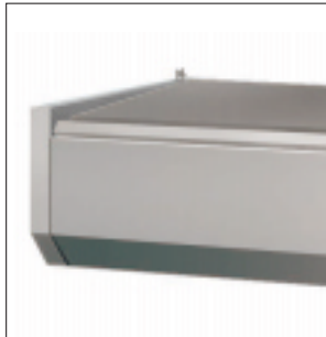
Solid top option