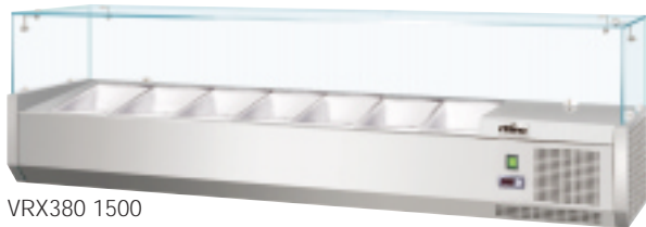
VRX380 1500 VRX330 1500