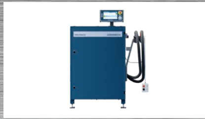
Rigorous quality control