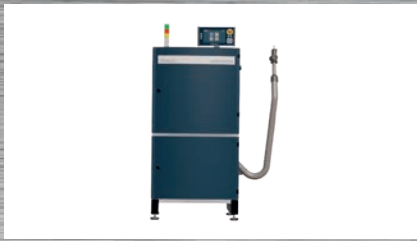
Advanced manufacturing equipment