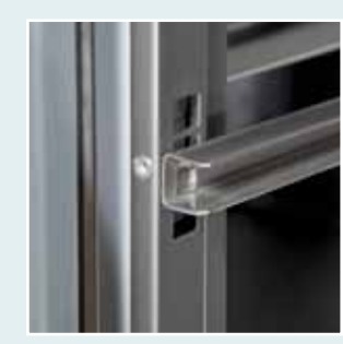
Anti-tilt shelf guides to ensure stability and increase safety