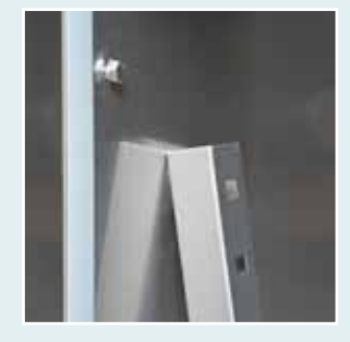
Removable shelf supports for deep cleaning