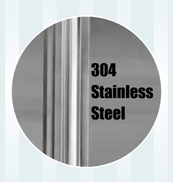
Highest quality professional 304 food grade stainless steel used both inside and out (rear is galvanised)