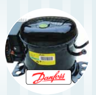
Experience the power of a Danfoss compressor