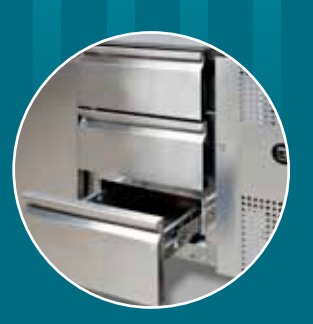
2 or 3 drawer options may be added