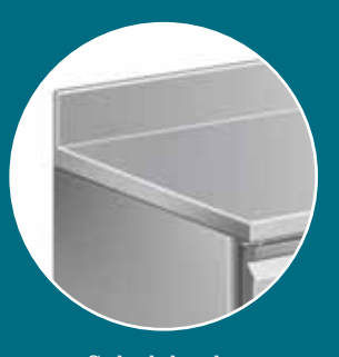
Splash backs 50mm or 100mm available