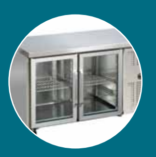
Glass door options available (with interior lights)