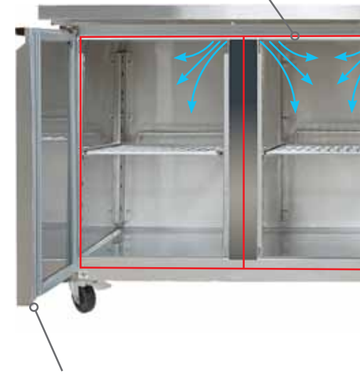
Doors stay open at a 90° angle and above for easy access.

Heated door frames on freezer models to eliminate condensation and ice up