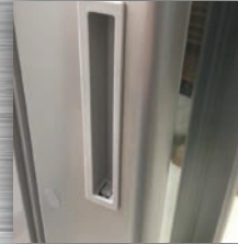
Neatly recessed finger grip handle