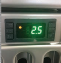
Electronic control for accurate temperatures

Glass Bottle 330ml (Heineken) 80 Glass Bottle 330ml (Castle) 80 Glass Bottle 568ml (Bulmers) 80