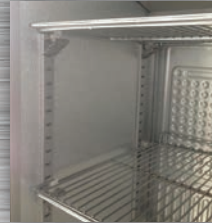
Aluminium interior, with closely spaced shelf adjustment strips