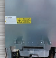
Smooth cabinet rear: No ugly refrigeration grilles